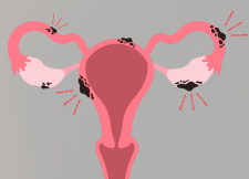
Endometriosis Awareness Month

To find out the more information click here .