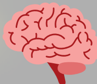
Brain Awareness Month